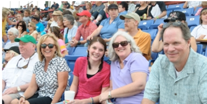
Some of the rousing crowd having fun in the First Pres special section.